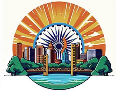
SACRAMENTO ASSOCIATION OF INDIAN NURSES