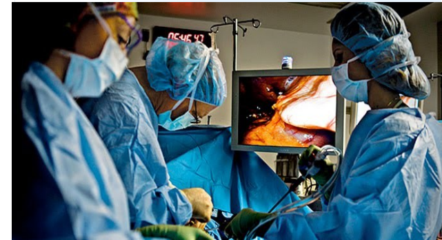
Professional Development for Perioperative Nurses

May 23rd-24th, 2026 16.0 contact hours provided